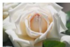
Golden Rose of City Hradec Králové, 'Anggun' (MEIbokir) by House of Meilland