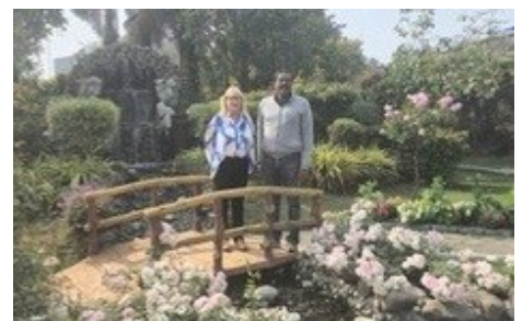
Left: Judging the MD Rose Show, Middle: Royal Family of the Show, MD Rose Show, Right: At Ooty