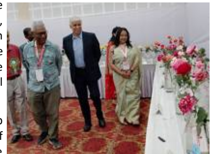
Viewing the Jamshedpur Show

The anticipation of further visits from WFRS top officials in 2026 and 2027 underscores the level of global attention this event is receiving. These collaborations will surely make the convention a landmark event, not just for the rose community,