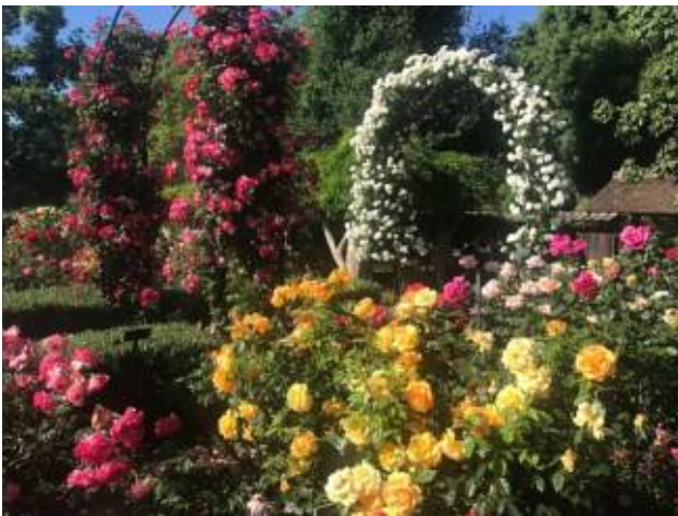
One of the many beautiful vistas at the Huntington Botanical gardens, one of our newest Associate Members

Please consider taking some time to become familiar with each of these prestigious entities. A basic internet search will take you to their websites. Welcome to all four! May they enjoy being part of the WFRS as much as we appreciate having them.