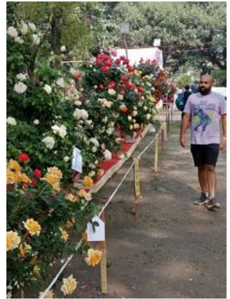
Bengal Rose Society Rose Show—Roses in Pots