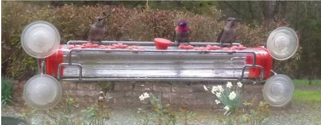
Here in the Americas, daffodils and the return of Hummingbirds to the feeders is a sure sign Spring is near