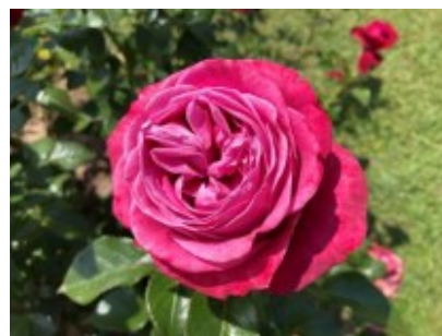
Barcelona, Spain Top Scoring Rose, 'Ruby Kiss' by Kordes