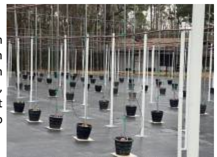
Rambler Project, ARS, Shreveport, LA, USA

I look forward to the pleasure of seeing many of the readers of this report at the upcoming World Rose Convention in Japan. If we haven't yet met, please make a point of seeking me out to introduce yourself. Thank you.