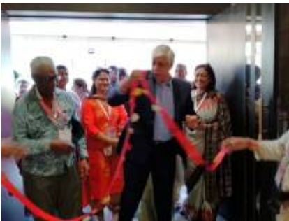
Inauguration of Jamshedpur Show