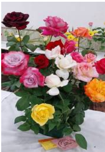
Rose Show at Nagpur by Vidarbha Rose Society

With past successes of WFRS Regional Conventions in Jaipur, Hyderabad, and Kolkata, hosting the global event in the City of Lakes—Bhopal, for the first time in India, is a massive achievement. Welcoming over 500 rose enthusiasts and experts from around the world is sure to create a fragrant and colourful celebration.