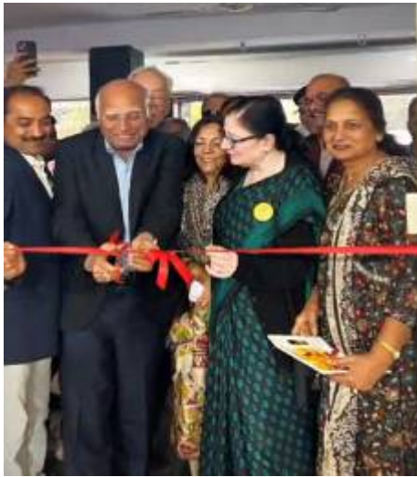
Inauguration of Rose Show at Jabalpur

The Pishori Lal Sahni award was awarded to Co, 2 TT R Indian Army.