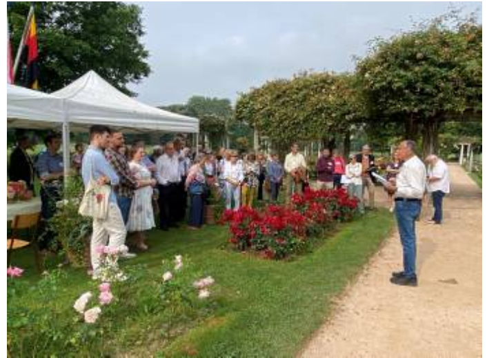
Left: Judging Bologna Rose Trials in Faenza, Italy, Right: Getting judging instructions at Parc Tete d'Or in Lyon, France