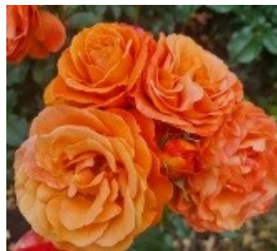
New Zealand, Palmerston North, Gold Star of the South Pacific, 'Phoenix' (Korrosobi) by Kordes